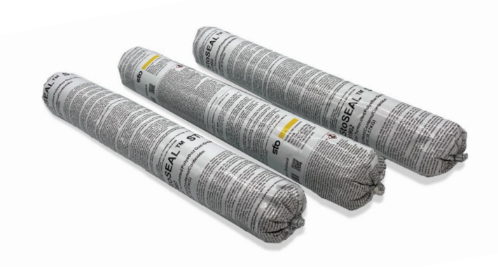
StoSeal STPE Sealant

Sto's new sealant combines the excellent adhesion and movement capability of silicone with the flexibility and compatibility of polyether chemistry. The result is a paintable, low dirt pickup sealant that is ideal for use in new opaque wall and building restoration applications.