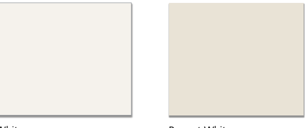
White Precast White